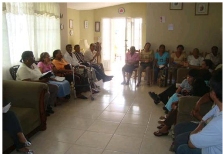
Breakfast & fellowship for seniors- Aug. 21

The second Saturday of each month the seniors of our local congregation meet together to have breakfast and Bible studies at different homes. Last Saturday (August 21 st ), they invited the seniors from the congregations of Pedregal and