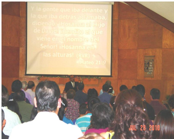
Main Lecture: "Para Dios no hay fronteras"

We always thank God for giving us the opportunity to spread His Word in our country and to share the fruits of our mission effort with you.