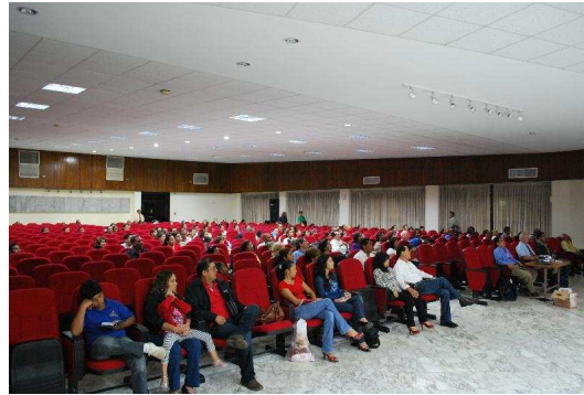
Lecture at the University of Panama