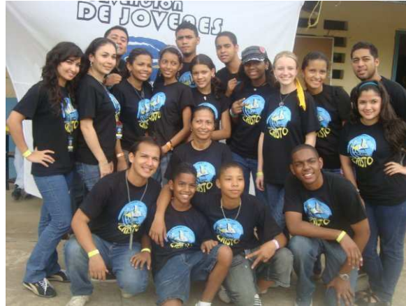
The Metropolitan Church of Christ Youth Group