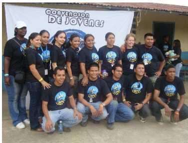
The J.O.S.I.A.S. GROUP

It's always pleasant to keep you informed about the progress of our mission effort in Panama.