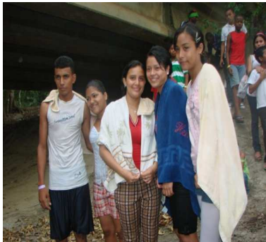
National Youth Convention 8 youth were baptized